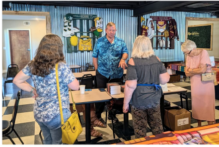
Chestatee River DARBOOK CLUB , Polo & Golf Country Club, Cumming, GA February 22