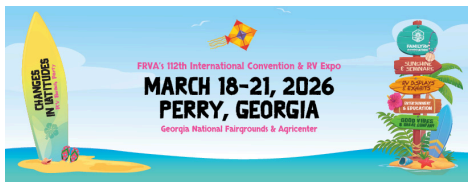
Family RV Association International Convention & RV Expo , Perry, GA March 21